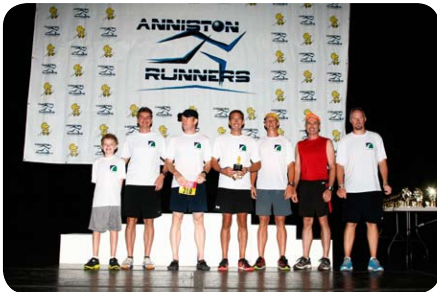
Team NABI took home the win for the Men's Fastest Team for the 2012 Woodstock 5K, with an average time of 20:29.