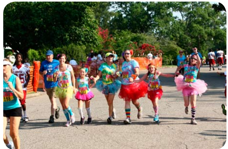
Team Flower Power took home the coveted Most Team Spirit Award for 2012!