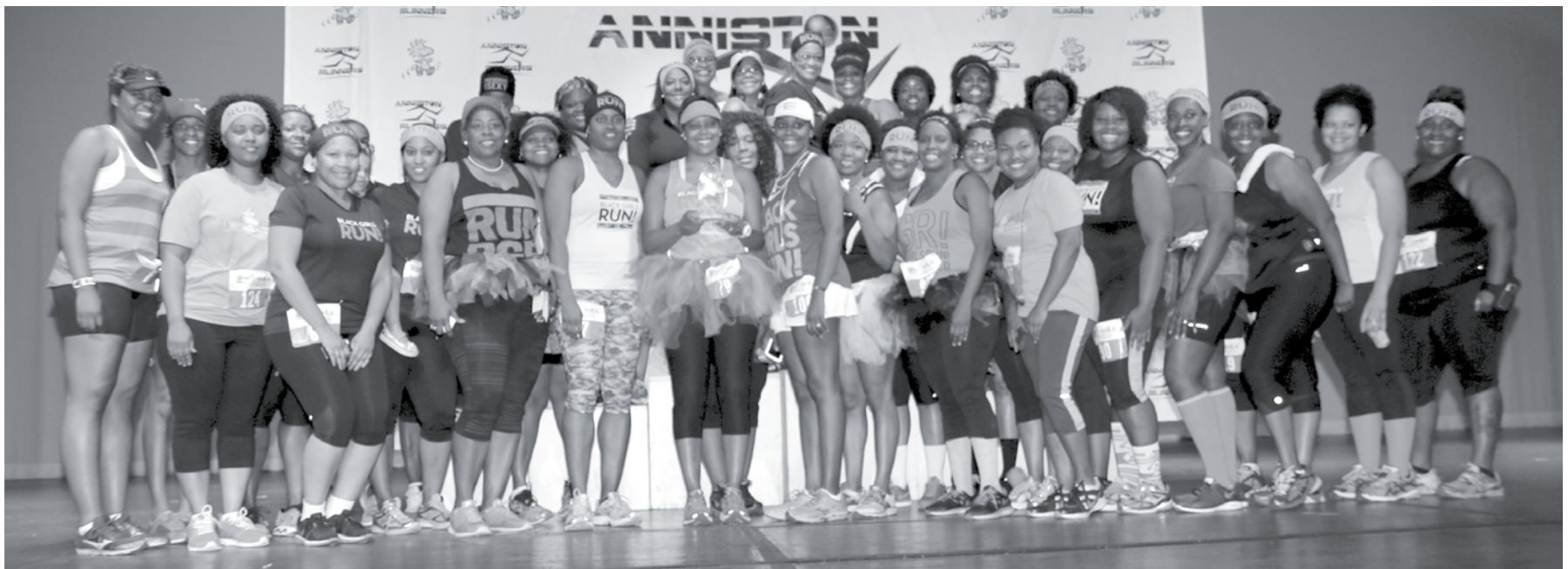
Caption: Team Black Girls Run took home the Team with the Most Participants award and the cash prize in 2014!