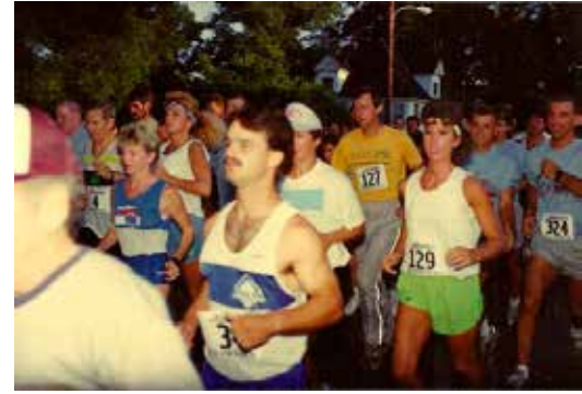
Woodstock 5K 1989 race.

by Neeli Faulkner Woodstock 5K Co-Director