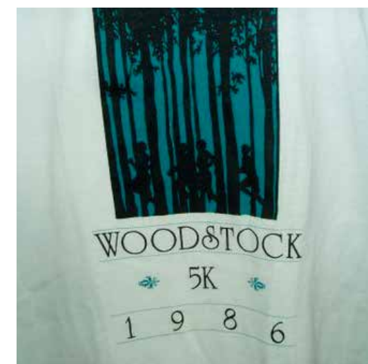
Woodstock 5K 1986 race shirt.