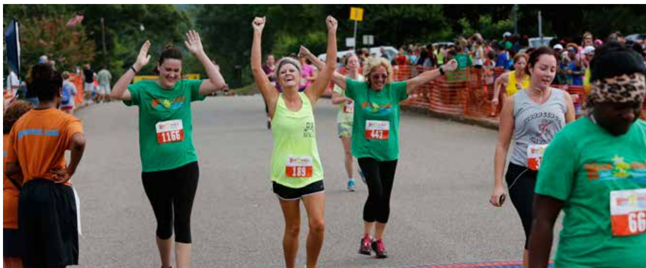
Woodstock 5K participants celebrating their finish at the 2014 race.