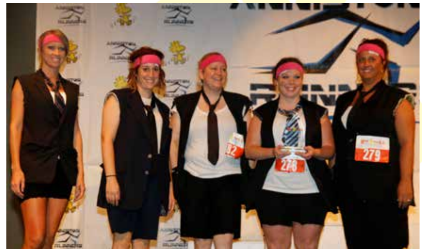
Caption: Team Mayhem (inspired by the Allstate commercials) took home the coveted Most Spirit Award in 2014!