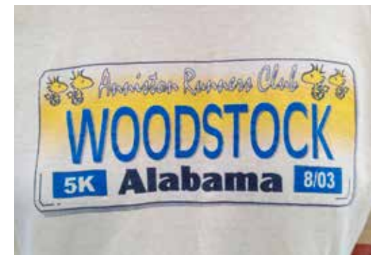
Woodstock 5K 2003 race shirt.