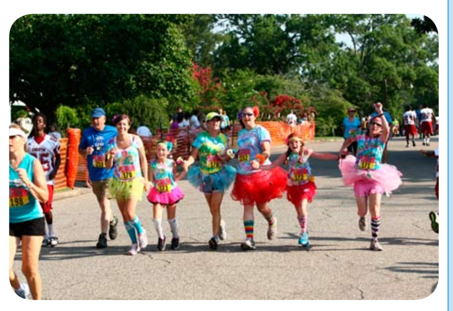
Team Flower Power took home the coveted Most Team Spirit Award for 2012!